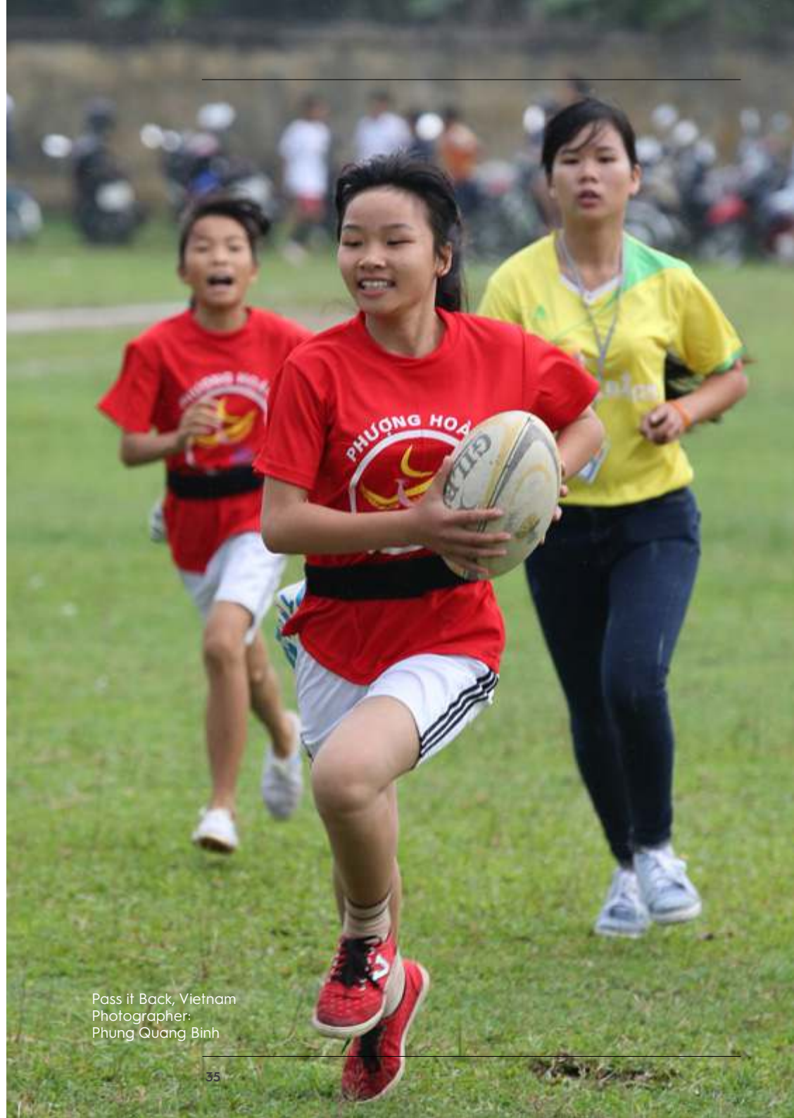
Pass it Back, Vietnam